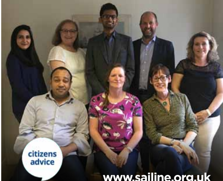
The SAIL Team

Free advice for all seafarers and their families